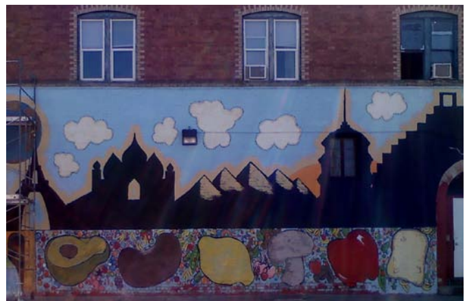
Project wall after