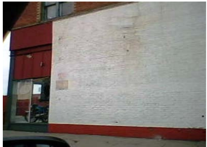
Project wall before

SFCC service-learning students worked tirelessly to create a work of Art on the Historic Inland Hardware building and future home of One World Spokane. World landmarks and nature's bounty share the earth in this colorful and whimsical mural, thanks to all those who participated.