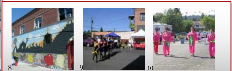
One World Spokane